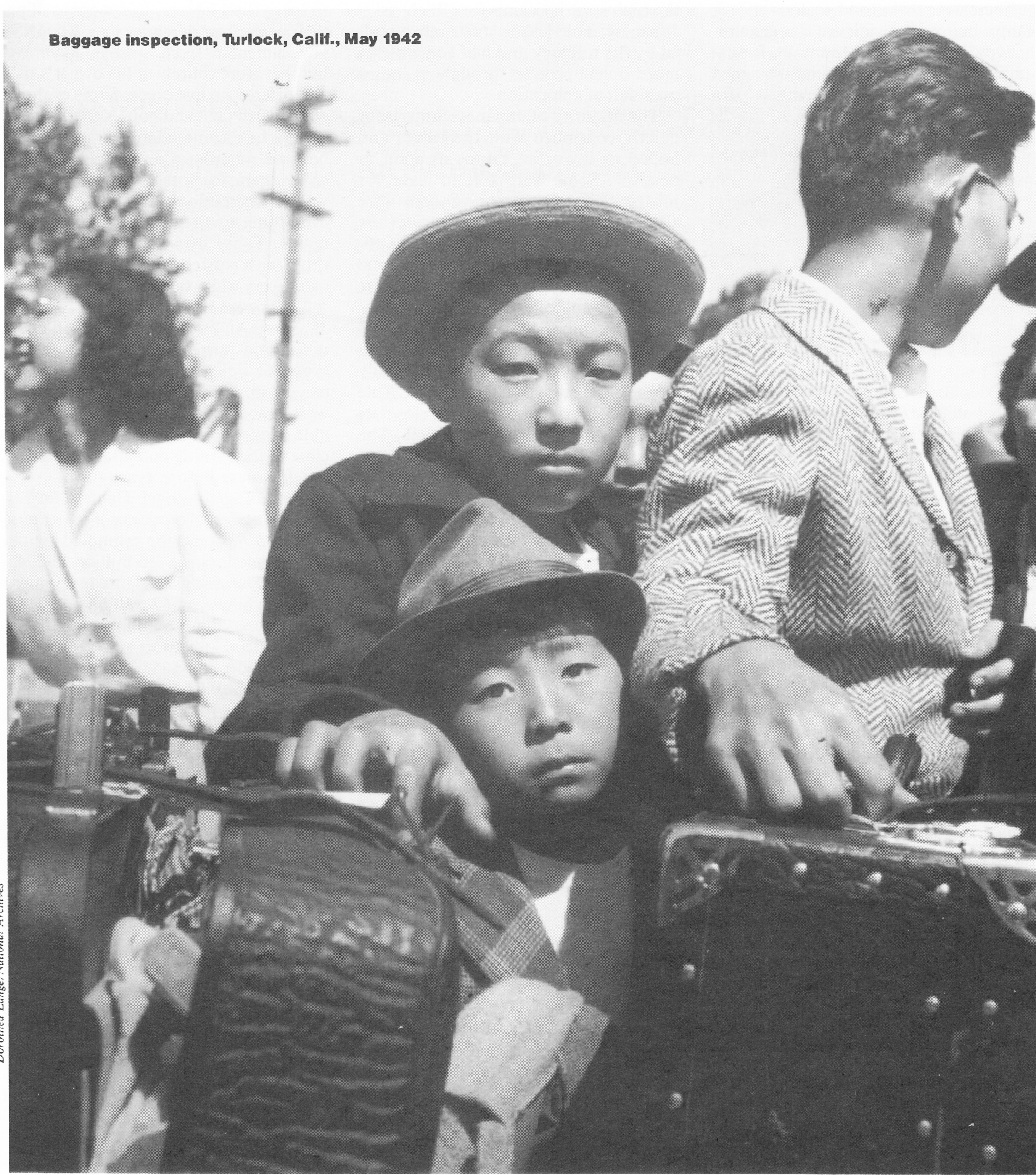
Baggage inspection, Turlock, Calif., May 1942

The people lived in barracks, and each family was allotted one room, about 20' x 10'. The walls were very thin, offering little privacy from neighboring families. There were lines for everything: to eat, get water, see a doctor, even to use the bathroom. The hospital was simply another barracks with no true sanitary conditions. There were outbreaks of dysentery and other diseases. The quality